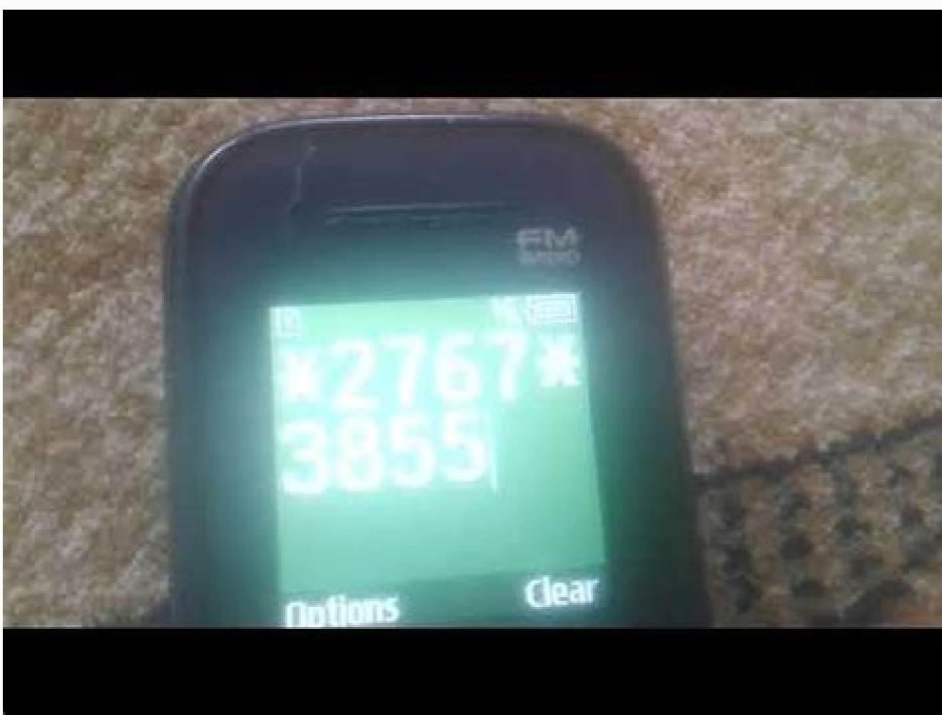
Samsung gt-e1205t format atma. Code formatage samsung gt-e1205t. Codigo para formatar samsung gt-e1205t. Samsung gt-e1205t format.